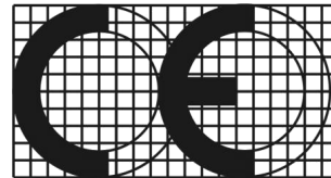
Fig. 2. CE marking model. Source [3].

Before Poland EU access, a safety certificate entitles the producer to the marking of the product by "B" safety mark was a confirmation that the product is safe.