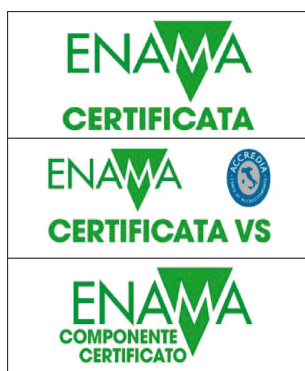
Fig. 6. Marking of ENAMA certification. Source [15].

Beside the manufacturers and end-users, also the policy makers may benefit from the ENTAM network activities getting, for example, a decision support system in providing incentives for the agricultural machines market. Incentives for purchasing of machines which have the ENTAM recognition may be funded thanks to their higher performance and safety standards. In Italy the ENAMA in cooperation with the Ministry of Agriculture has carried out a study investigating the incentives for certified machinery provided in the 2007-2013 Rural Development Programme (funded by the EU); a certain number of Regions provided incentives for the purchase of machines with a safety or performance certification. We can imagine that this trend may raise significantly in the next 2014–2020 Rural Development Programme. One of the leading issue, among the ENTAM working groups, is the need to identify new testing standards for the environmental performance of the agricultural machinery and equipment. The ENAMA is an Italian accredited association recognised in accordance with the provisions of Italian Presidential Decree n. 361/2000, its aim is to offer the agromechanical industry in Italy in order to improve competitiveness, enhance technology and raise awareness of the performance and safety features of the machinery amongst the stake holder of the agricultural sector.