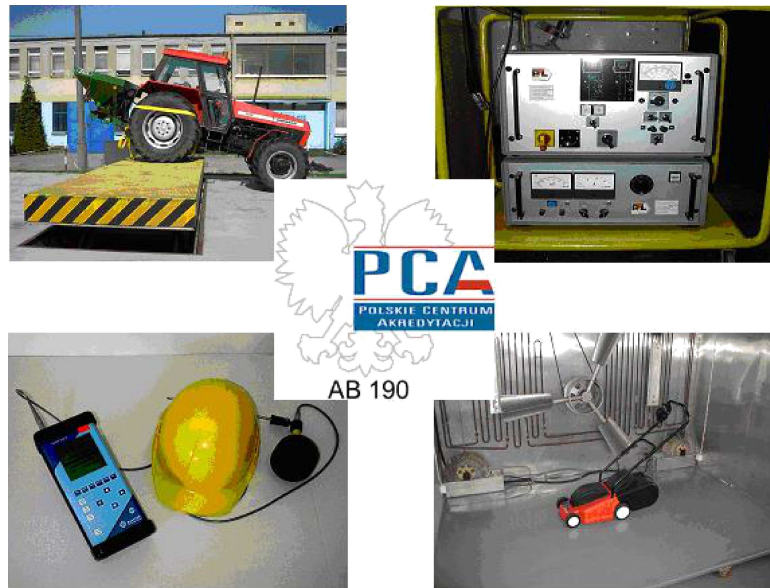
Fig. 5. Examples of testing stands in Testing Laboratory for Agricultural Machines of PIMR.