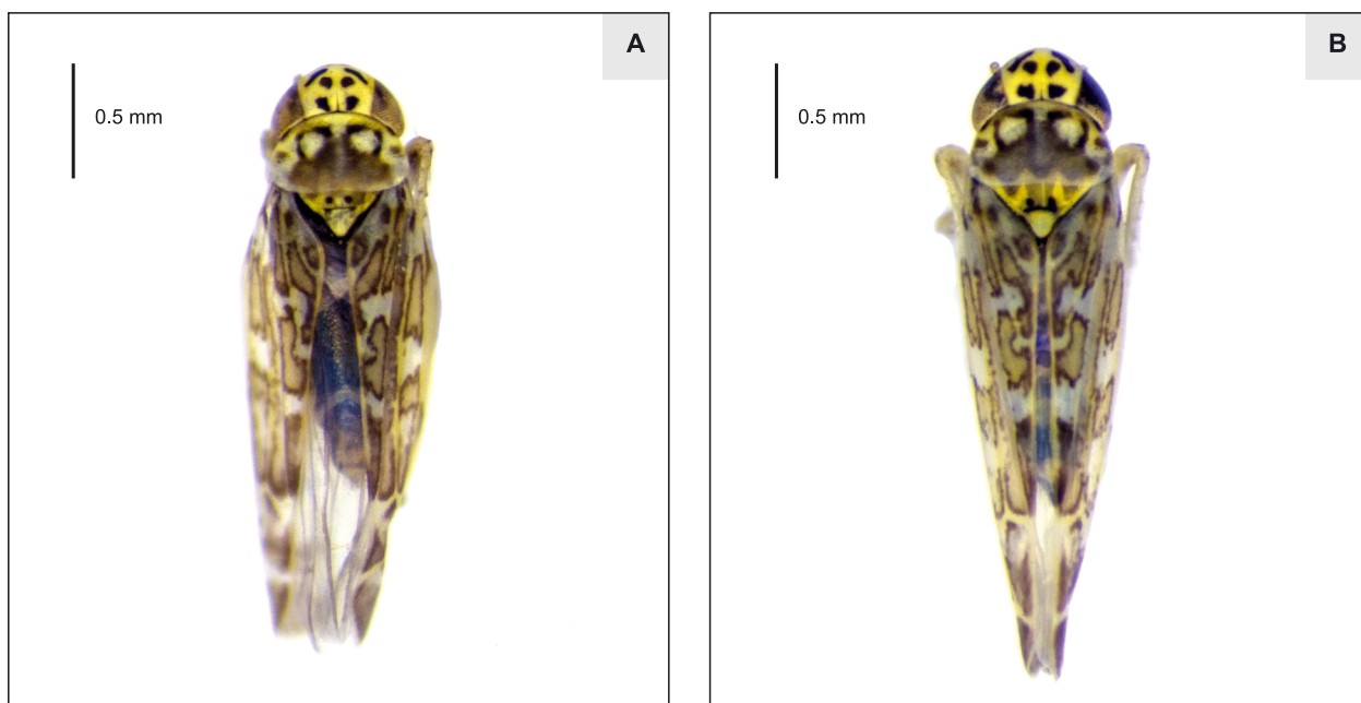
Fig. 1. Male (A) and female (B) of Eupteryx decemnotata