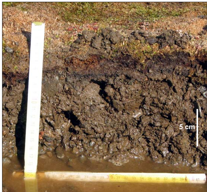
Fig. 5. Hyperskeletal Cryosol (Reductaquic) with thin histic-like horizon.

1.2%) (Table 2). Such soils cover 2.5% of the studied area and are habitats for lichens, Saxifraga oppositifolia , and Cerastium arcticum (Table 1). Rock outcrops forming from marbles are parent material for thin Lithic Rendzic Leptosols. The soils exhibit sandy texture, alkaline reaction and quite high content of carbonates. Content of soil organic carbon is similar to that of Lithic Leptosols ( i.e. 1.0–1.5%). Lithic Rendzic Leptosols are covered by lichens, Saxifraga oppositifolia , S. caespitosa and Polygonum viviparum .