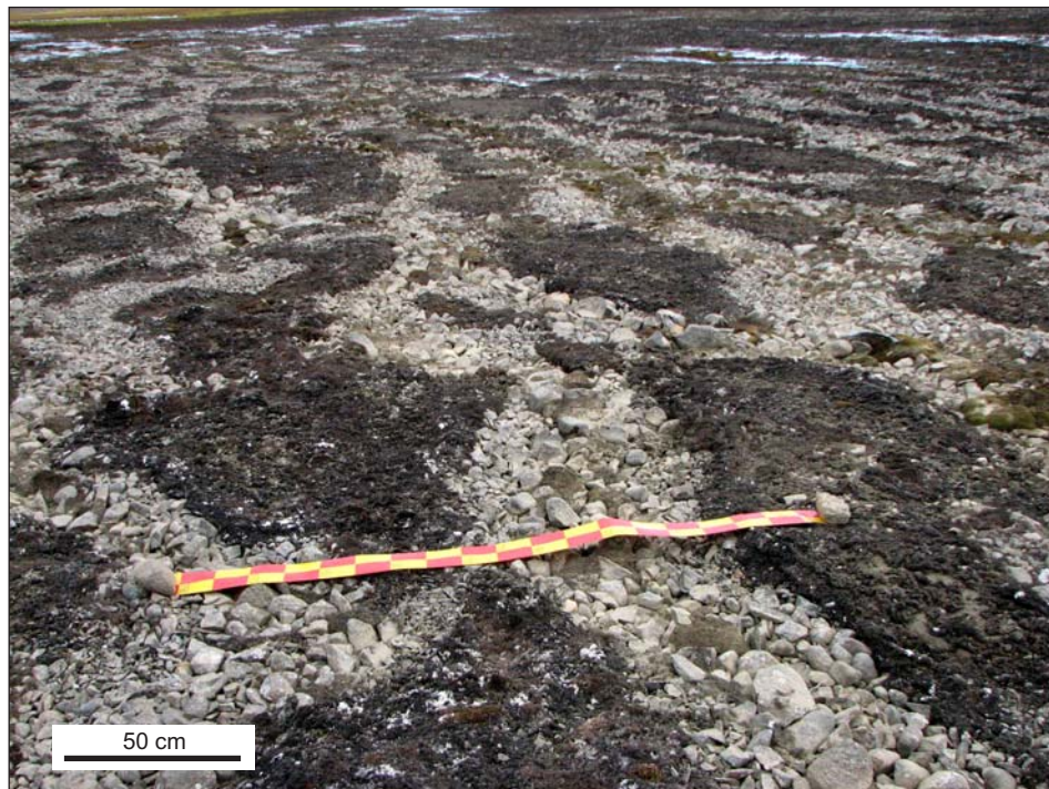
Fig. 3. Patterned ground showing clear segregation by frost.

soil material due to cryoturbation. Chemical composition of Turbic Cryosols is similar to the composition of Haplic Cryosols (Table 3). However, Turbic Cryosols contain lower amount of \text{SiO}_2 (63.7–65.9%) and higher amounts of \text{Al}_2\text{O}_3 (17.0–18.3%) and \text{Fe}_2\text{O}_3 (8.4–8.9%) than Haplic Cryosols, which is likely related to higher amounts of aluminosilicates ( i.e. clay minerals) and lower amount of quartz in Turbic Cryosols than in Haplic Cryosols.