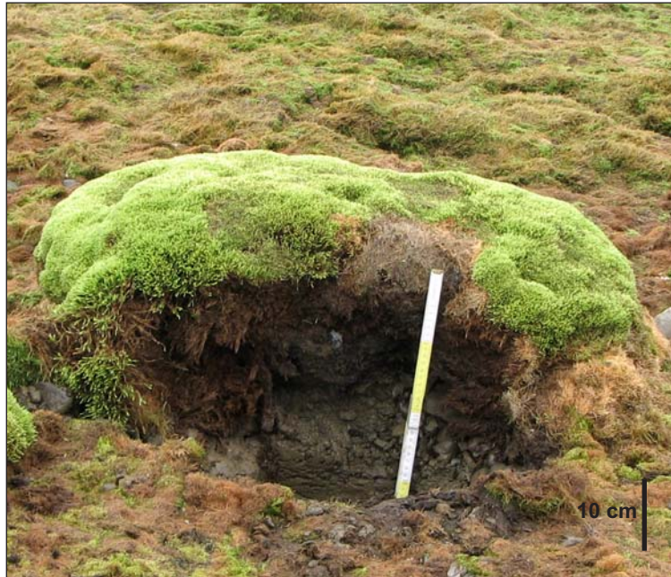
Fig. 6. Thufur containing ice lenses (visible in central part under moss carpet).

surface is often covered by sparse vegetation. In some places, with high influence of birds, Leptic Regosols (Ornithic) (Profile 033) are almost entirely covered by mosses ( Brachythecium turgidum , Sanionia uncinata ), Arctic mouse-ear ( Cerastium arcticum ), grass ( Poa alpina var. vivipara ) and Chrysoplenium tetrandrum being the most common species of vascular plant (Table 1). It is related to enrichment of surface horizon of the soils in nitrogen and phosphorus (Tables 2 and 3). Such soils (covering 6.5% of the catchment) show sandy loam texture, lack or very low amount of carbonates and slightly acidic or neutral reaction (Table 2). High content of soil organic carbon (up to 11.2%) in such soils is effect of dense vegetation cover which provides organic substrate. On the rock outcrops occurring close to Leptic and Haplic Regosols, very thin Lithic Leptosols are also present.