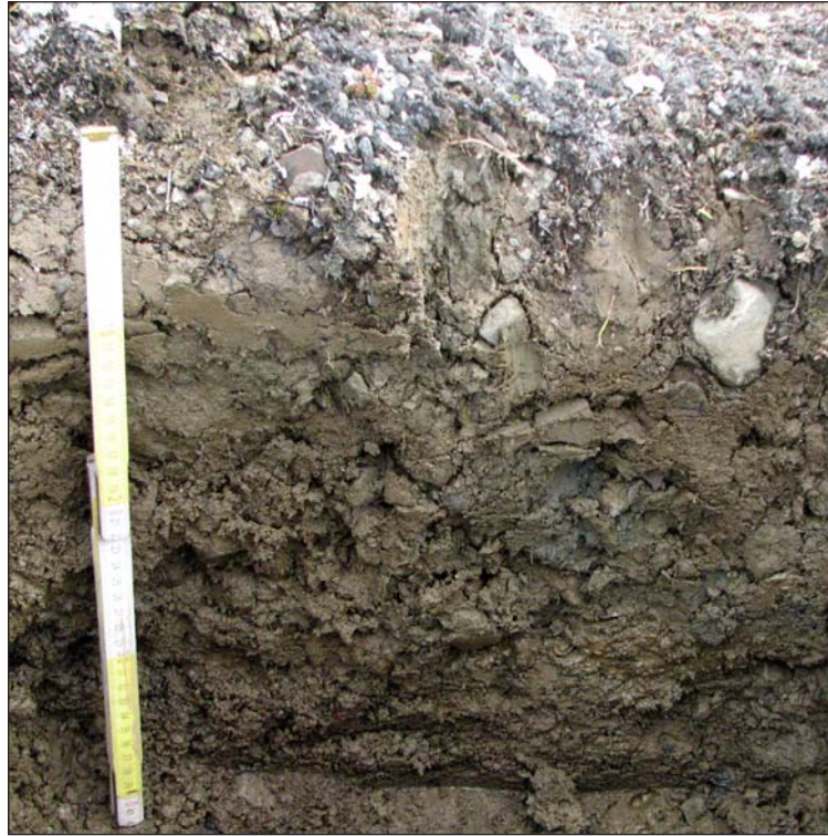
Fig. 4. Turbic Cryosol with permafrost occurring at 40 cm.

thufurs, i.e. small mounds which height is 30–40 cm and diameter 40–50 cm occur (Fig. 6). Turbic Histic Cryosols and thufurs are covered by moist carpet of mosses (Table 1, Fig. 6). Such carpet of mosses have strong insulating properties which lead to frequent presence of discontinuous ice lenses as well as shallow occurrence of permafrost (usually at 20–30 cm under soil surface) (Fig. 6). Hyperskeletal Cryosols (Reductaquic) and Turbic Histic Cryosols are habitats for wet moss tundra with Sanionia uncinata , Warnstorfia sarmentosa , Starminergon stramineum , Aulacomnium palustre , which cover 90–100% of soil surface. It is connected with high amount of water, which is enriched in nutrients (nitrogen and phosphorus) originating from bird colonies ( Alle alle ) located on slopes of Arikammen and Fugleberget. The same close relationships between vegetation and soils rich in water and nutrients are indicated by Klimowicz et al. (1997) and Skiba et al. (2002) from other parts of the Spitsbergen ( i.e. Bellsund region and Sørkappland, respectively). On small old skerries occurring within the study area very thin, initial Lithic Leptosols (Profile 023) are formed (Table 1). Genesis of such soils is connected with high resistant of crystalline rocks to physical weathering (Skiba et al. 2002). Such soils are characterized by sandy or sandy loam texture, slightly acidic or neutral reaction, lack of carbonates and low amount of soil organic carbon (up to